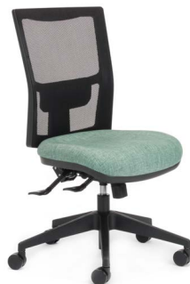
Team Air Ratchet