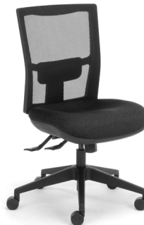
Team Air Heavy-duty