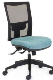
Team Air Task