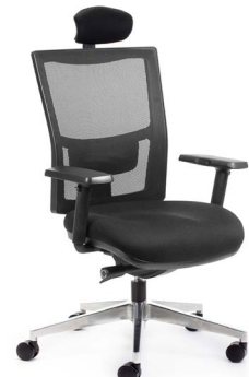
- Optional head-rest and alloy base

* Please confirm lead times when placing order.