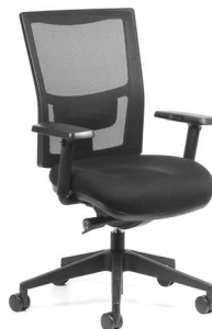
Team Air Executive, Arms