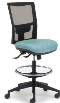
Team Air Task, Drafter