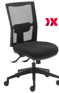
Team Air Task, CS-XPRESS