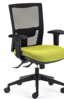
Team Air Heavy-duty, Arms