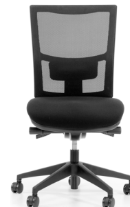
Team Air Executive