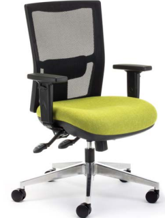
Team Air Heavy-duty, Arms, alloy-base